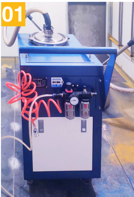
Installation of inlet/outlet pipes