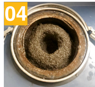
Cleaning up scraps